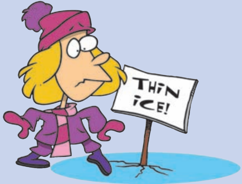
ONTHECOVER: Cross country skiing in Jackson Village